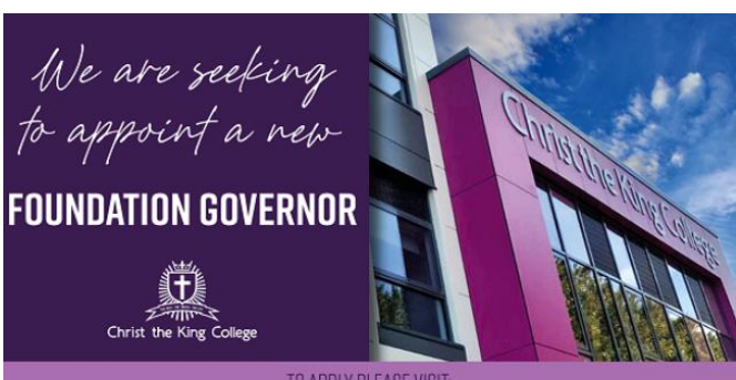
TO APPLY PLEASE VISIT: www.christthekingcollege.co.uk/vacancies

We are looking to appoint a new Church of England Foundation Governor. If you are interested and would like further information, please visit our website