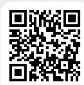
scan the QR code with your phone's camera for Parent Guides on how to help keep your children safe online

When you give a child access to the Internet, you give them access to the adult world.